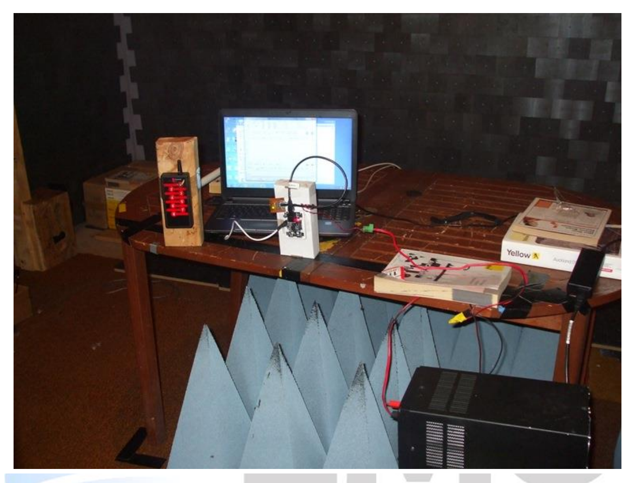
ESD test setup